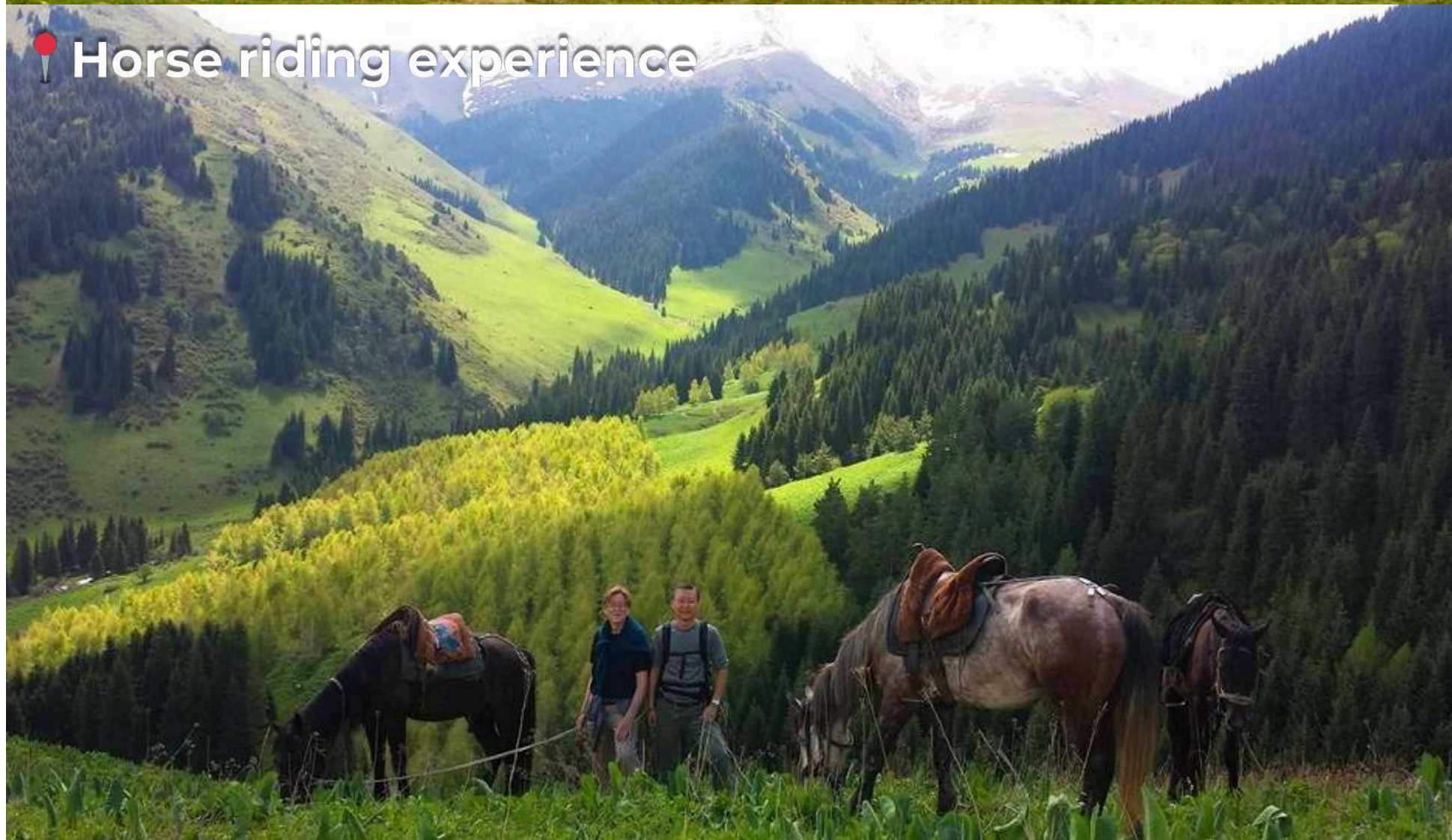
📍 Horse riding experience