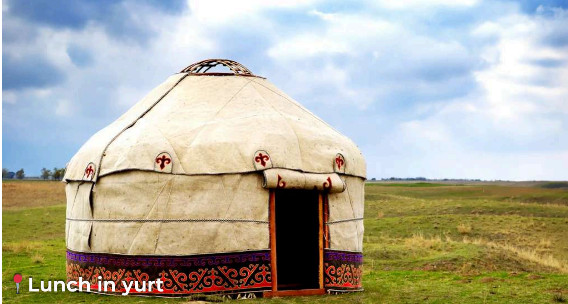
📍 Lunch in yurt