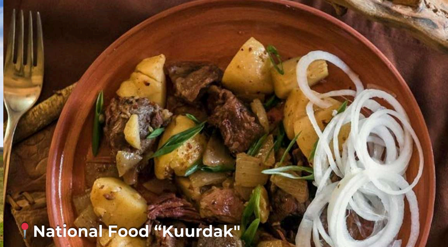
📍 National Food "Kurdak"