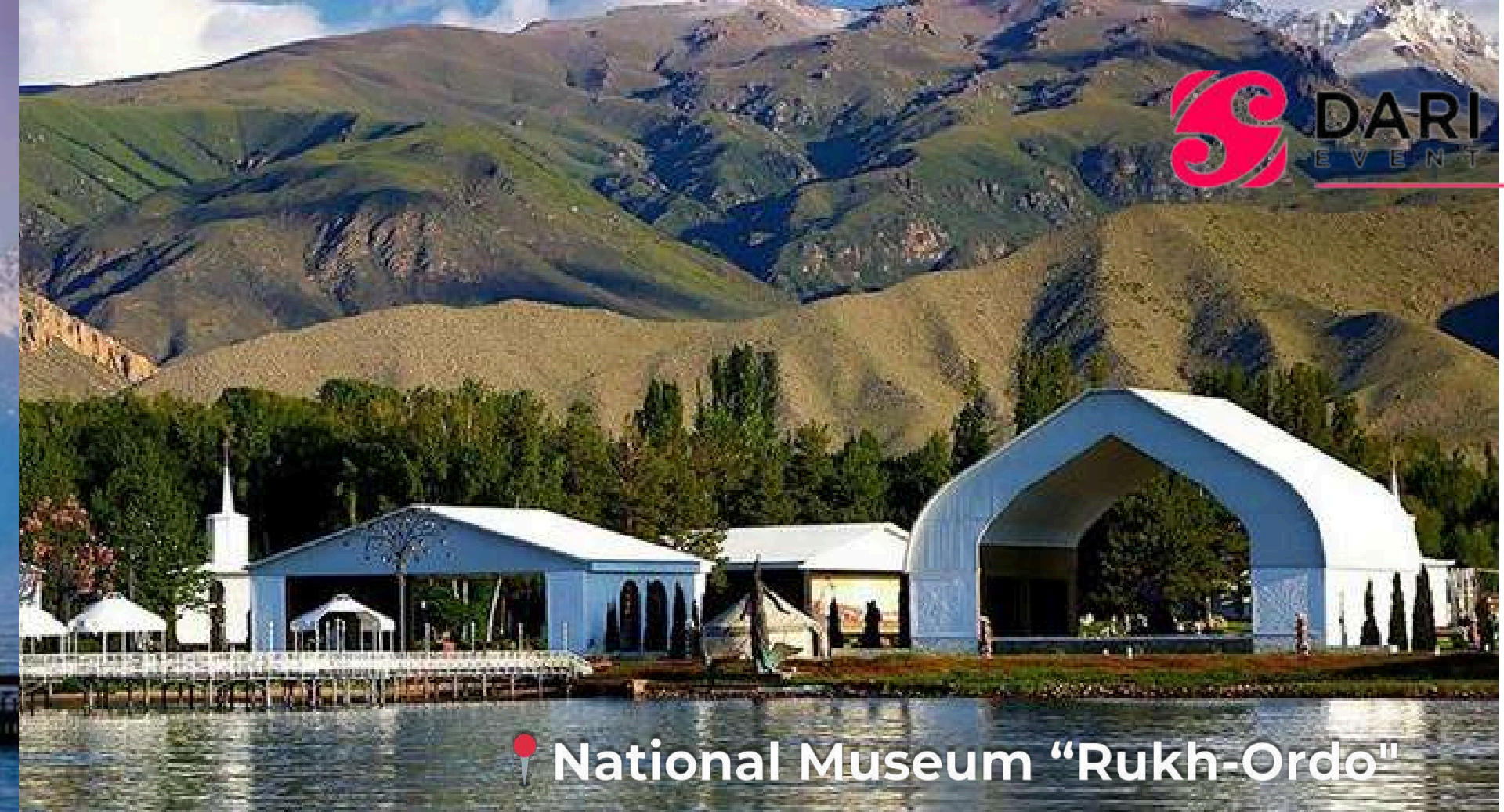
📍 National Museum "Rukh-Ordo"