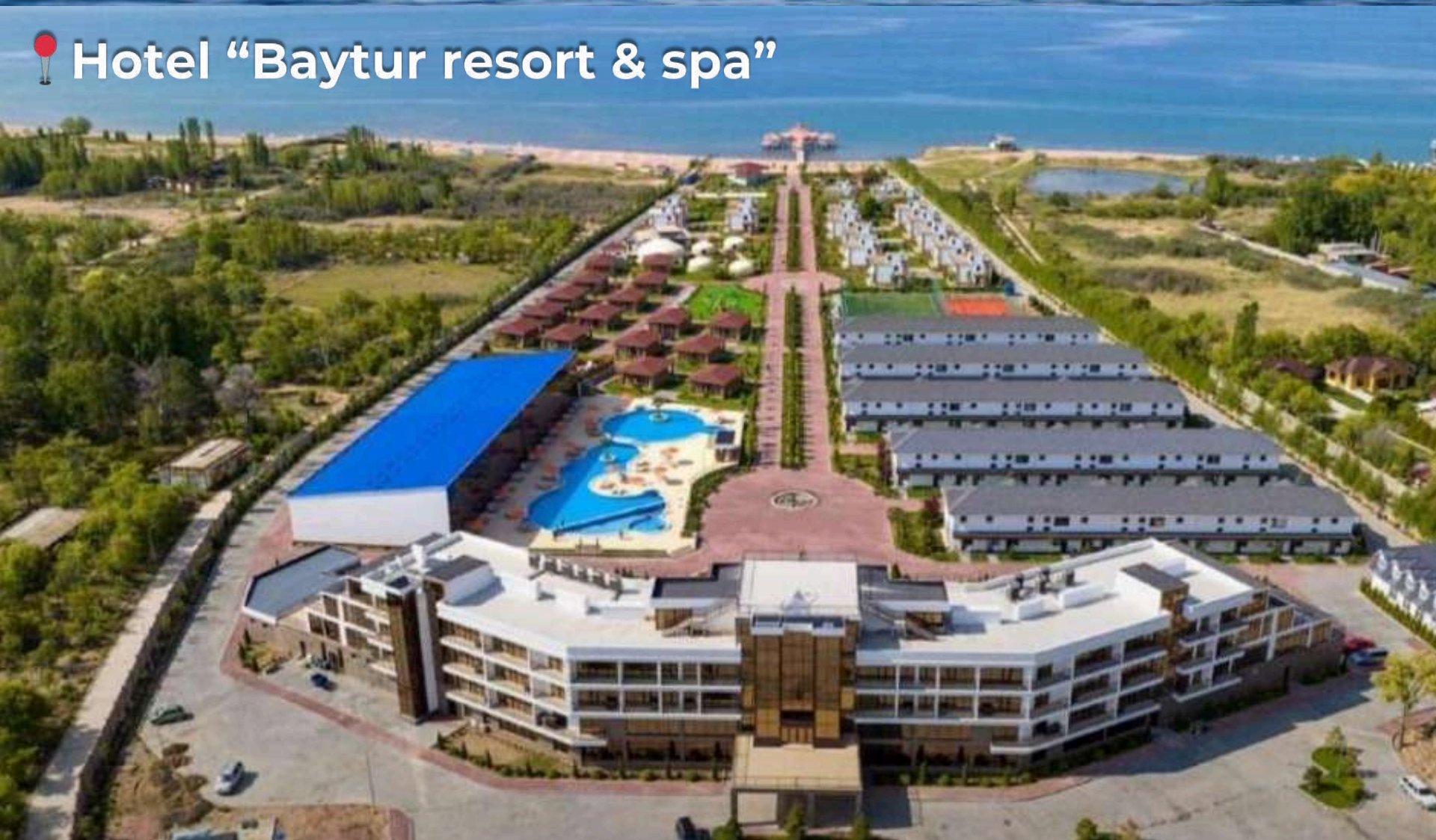
📍 Hotel "Baytur resort & spa"