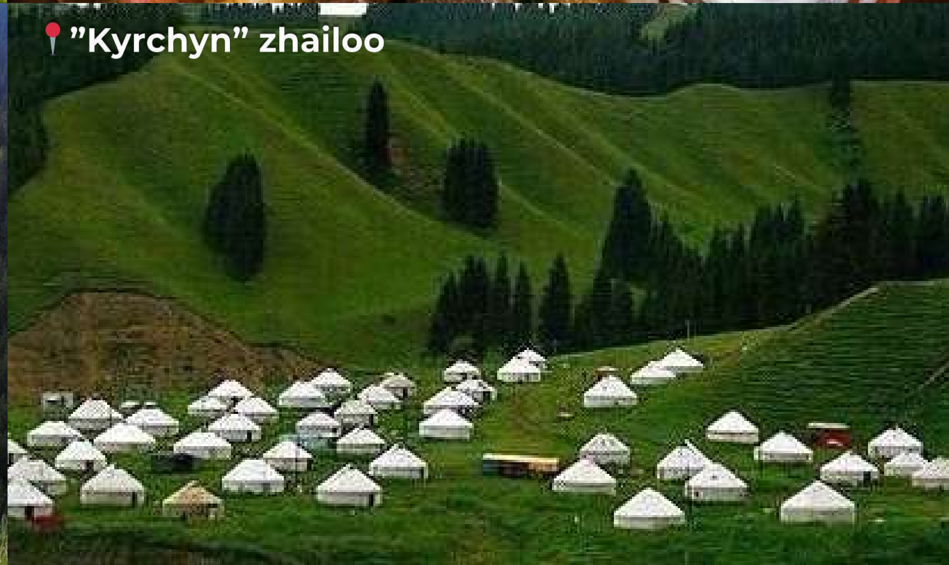
📍 "Kyrchyn" zhailoo