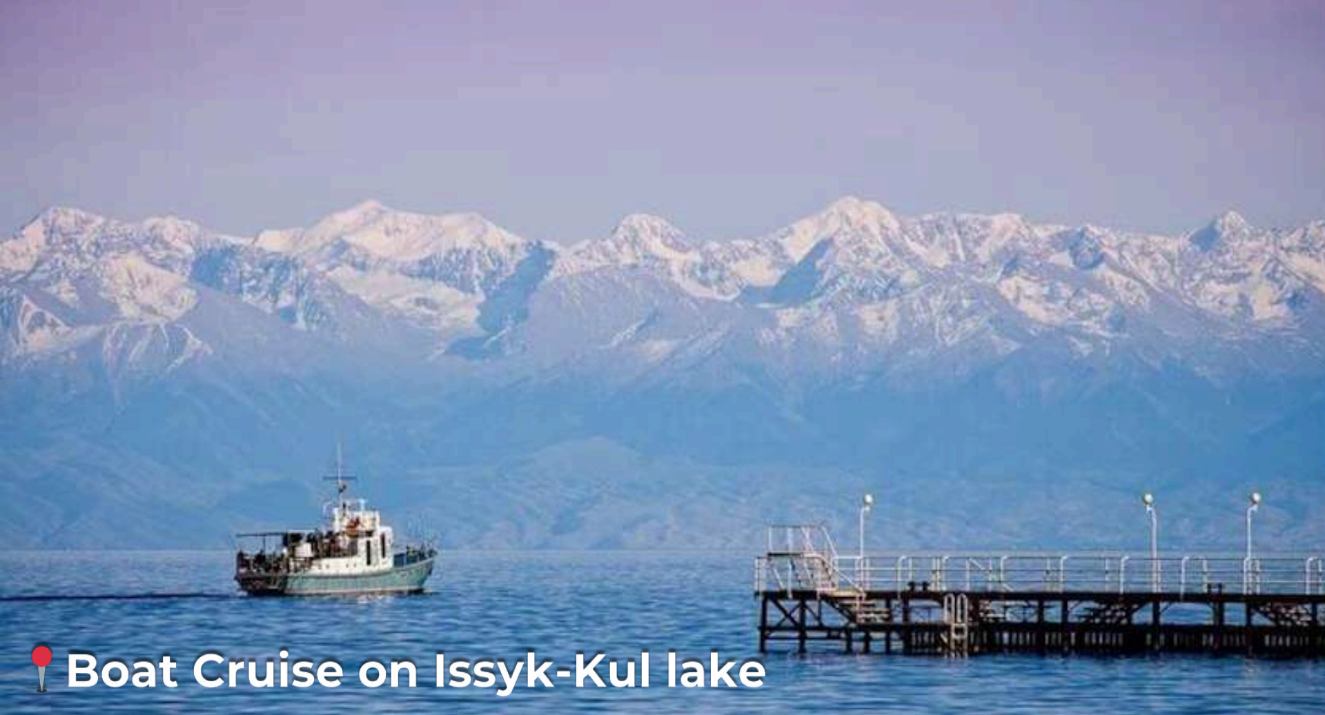
📍 Boat Cruise on Issyk-Kul lake